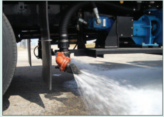
Street Flusher System