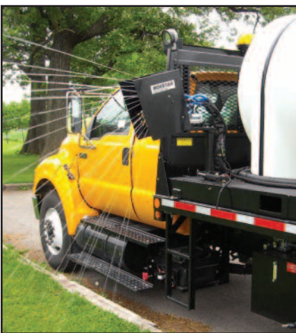
Spray Head: Front, Mid or Rear Mounted. Multi-Zone Spray Load with 30° Linear Actuation Tilt to Follow Ground Contour.