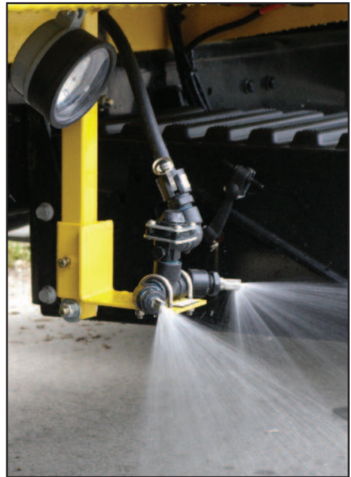
Guard Rail Underbody Spray Booms Manual or Power Height Adjustable. Optional Spot Light Shown